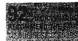
Sectoral distribution of visitors related to the subject of the fair (%)